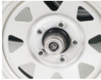
E-Z Lube Axle Offers convenient wheel bearing lubrication thru zerk fittings.