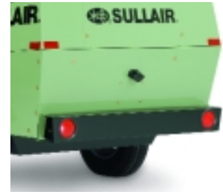
Rear Bumper Features recessed tail lights and license plate light.